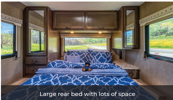
Large rear bed with lots of space