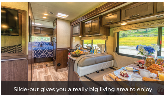
Slide-out gives you a really big living area to enjoy