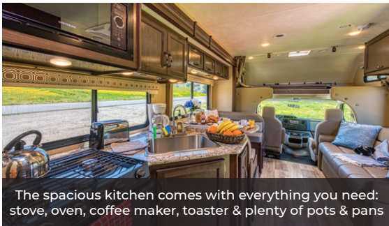
The spacious kitchen comes with everything you need: stove, oven, coffee maker, toaster & plenty of pots & pans